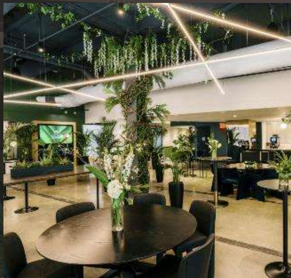
Spacious Meeting Spaces